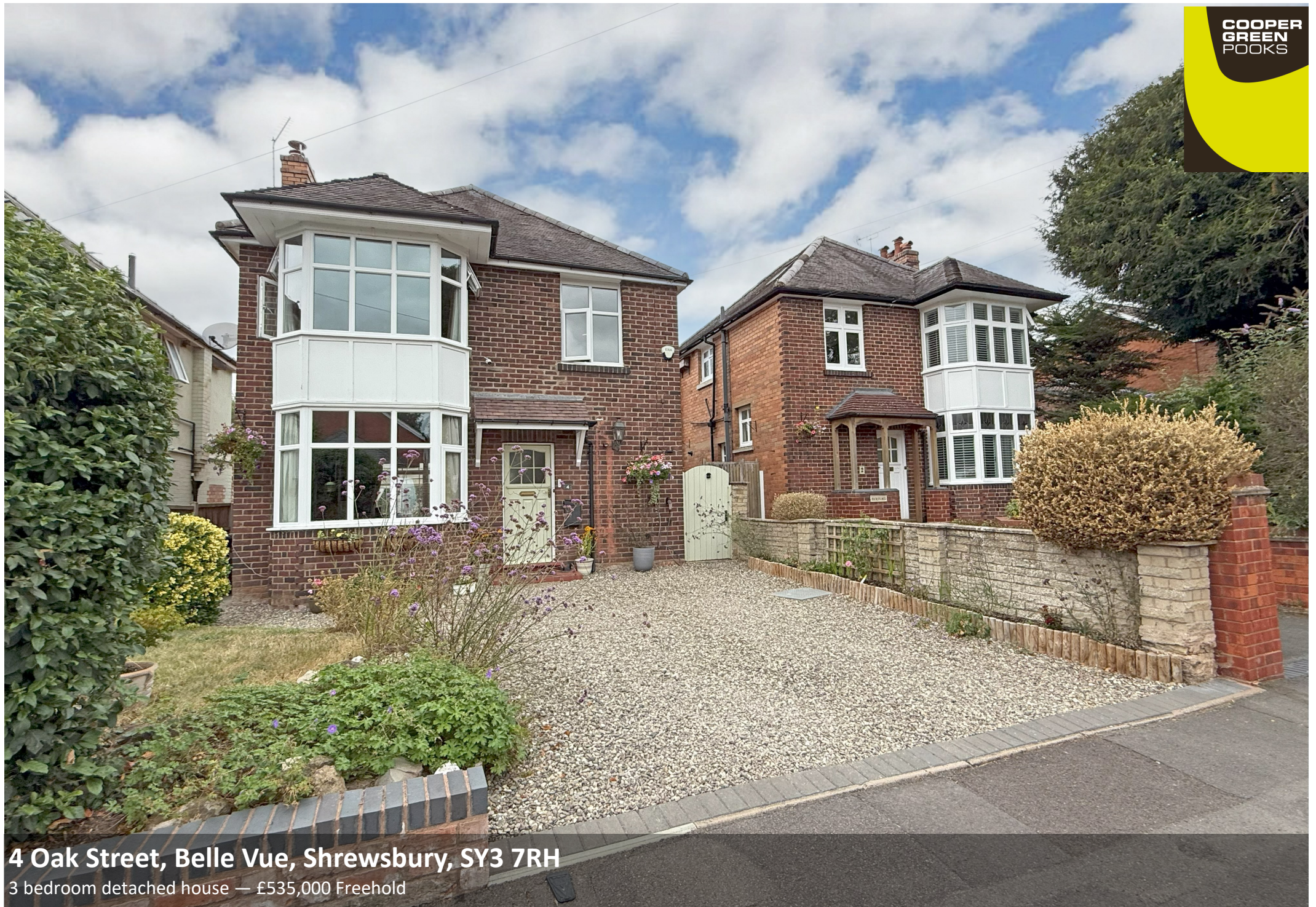
4 Oak Street, Belle Vue, Shrewsbury, SY3 7RH

3 bedroom detached house — £535,000 Freehold